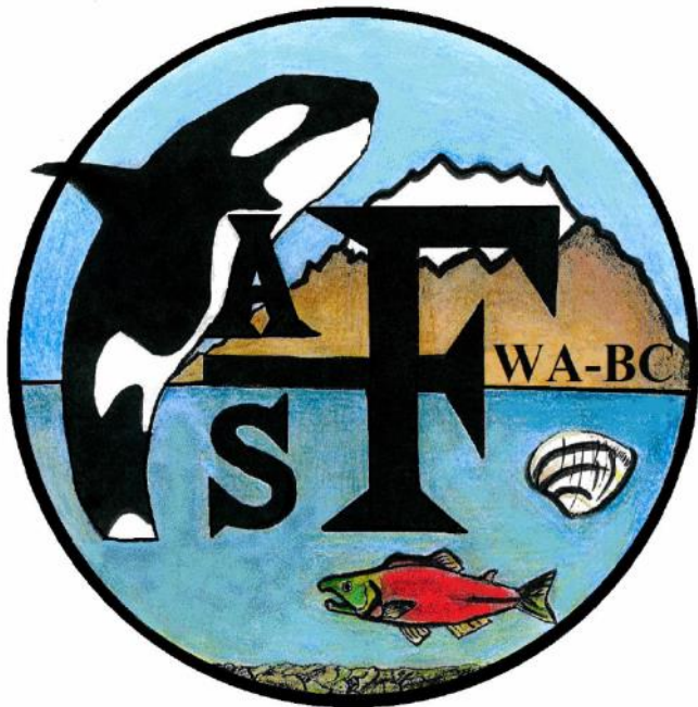
Submitted by Kaitlin Thurman