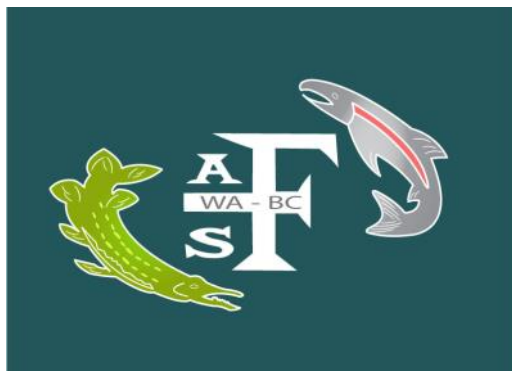
Submitted by Vaughn Lodge