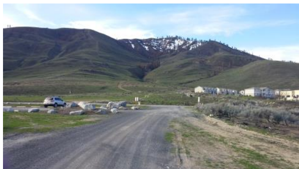
Near the turn-around point of the Spawning Run

discussions that stemmed from the talks.