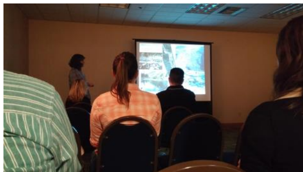
The last talk of the conference, with a big audience!