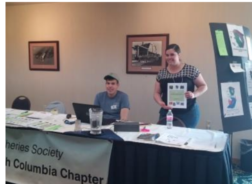
The UW and EWU Student Subunit Presidents working hard at the registration desk

We had a total of 133 registrations, including 7 students from University of Washington, Eastern Washington University, Bellingham Technical College, and University of Minnesota. All of the students contributed at least an hour of their time to helping out with the registration desk, the Spawning Run, and selling WABC swag.