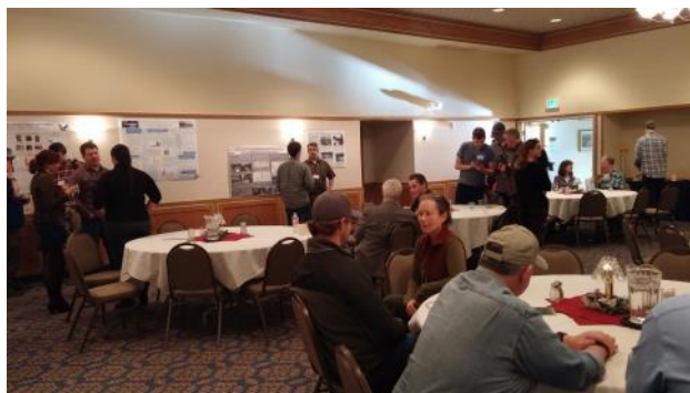
Great turnout at the Student-Mentor mixer!

Barely recovered from planning this meeting, the ExCom is already looking to the next one in 2017. Please see the next page for the Save-the-Date announcement and mark your calendars! Let's all work together to make the next AGM even better.