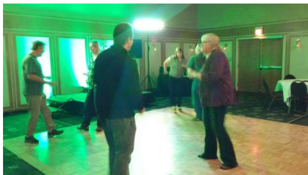
A few brave souls got the party started!